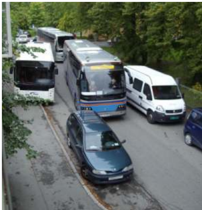
The buses were delayed on Forest Day because of a parked car.

Leaving the car unattended in the drop off zone right outside the school gates can lead to dangerous situations as emergency vehicles also need to use this entrance to enter the playground.