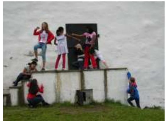
The Seniors went to Festningen for Activity Day

Our new after school activities for the children in Year 6 to 8 are starting up from week 37. On Mondays we offer a homework club where the children can work on their homework together with their friends and with the support of adults. On Wednesday the students can enjoy the activities at Club "Kalven". We also offer a dance workshop on Wednesdays and on Fridays it is time for Spanish Club. The School Choir meets every Thursday. The school choir caters for children from Year 2. They are planning exciting activities and concerts and would be happy for more children to join the choir. We have asked students to sign up for the different after school activities and will be sending out a letter to confirm places as there are limitations on the number of children who can attend.